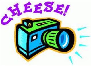
Photo Day is next Thursday 18 May . Envelopes for ordering and payment will be sent home with today's newsletter.